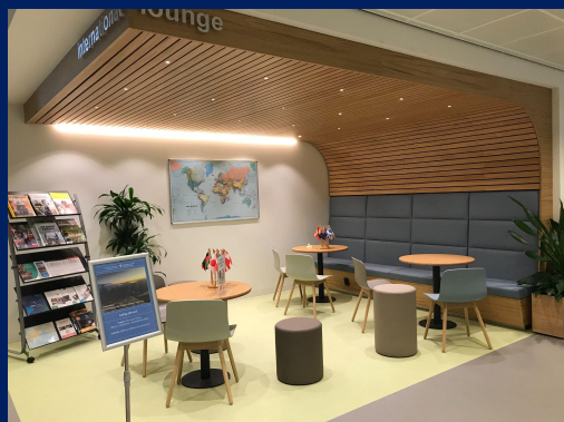
International Lounge ICT